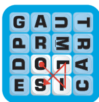
OILS (and OIL)