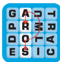
SOAR The O and A don't touch.