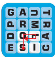
SOLO The one O is used twice.